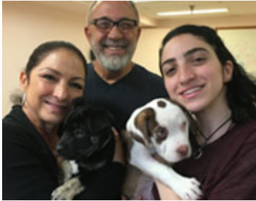
Gloria, Emilio and Emily Estefan with their newly adopted puppies, Tiny and Dot.